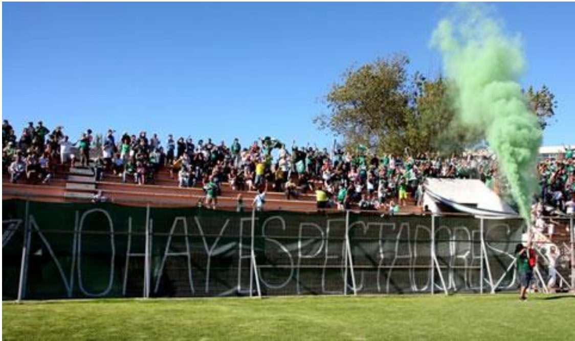
There are no spectators here,, 2010