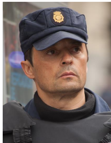
16 portraits, 2014