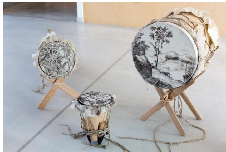
Palenqueros (2013)

Another element common to all the works in the Unruly Landscapes' exhibition is that dimension of landscape which permeates them, giving unity to the project. The viewer is absorbed into the political landscape of Colina 266 (2015) , a heartbreaking and gloomy landscape that bears witness to the scars of the Korean War, in which a battalion of 1,080 Colombian soldiers were sent by the Colombian state to support UN troops during the conflict. Or the sound landscape of Atrato (2014) , soundtrack that tell us of a group of local Afro-Colombian residents experiencing the "ordinary violence" of armed conflict.