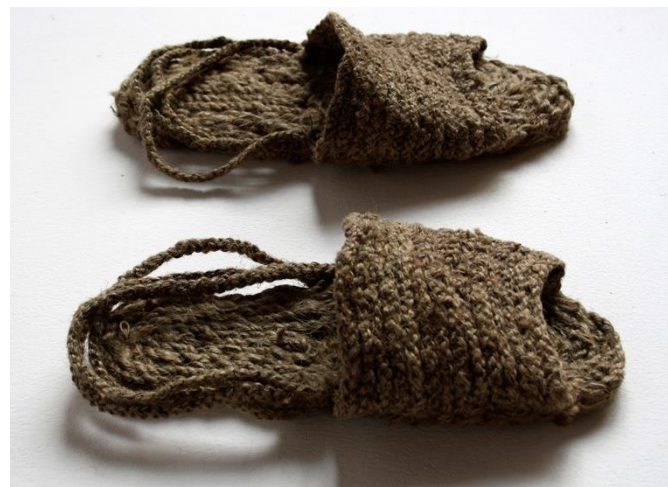
Zuratoque (2013)