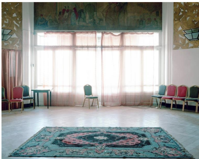
Hôtel El Safir, Ex-Aletti, Algiers City Center (2015) Residence of the Black Panther Party delegation during the 1969 Pan-African Festival of Algiers C-Print 100cm x 125cm

Foreign Office thus forms a combination of fragments in which "montage", orality, translation and poetry suggest an alternative historiography of utopias to reflect on potential gestures of resistance for the present-time, and potentially for the future.