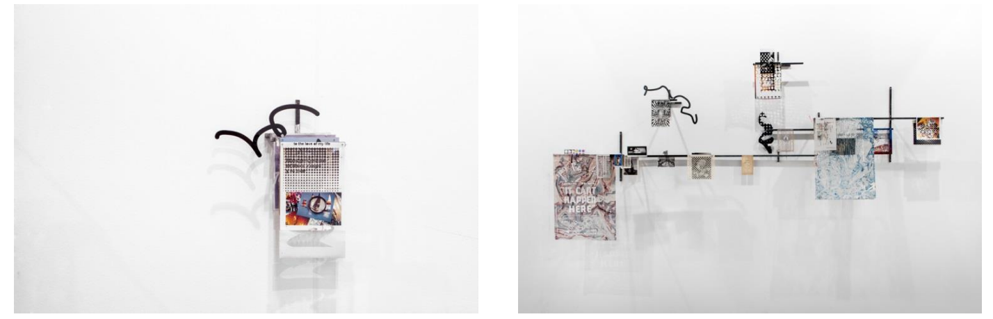
La puesta en macrha de un sistema (2015). Courtsey of the artist

Thus, as also happens in the illuminated panels which connect the exhibition space, the project imposes a return to the idea of deconstructing in order to rebuild; of questioning History, undoing it and rewriting it; of paying attention to certain information and its nuances; of looking through new filters and meanings and of working with different forms and techniques. Ultimately, these are projects with feedback loops that create a network where symbols, images and information display multiple readings.