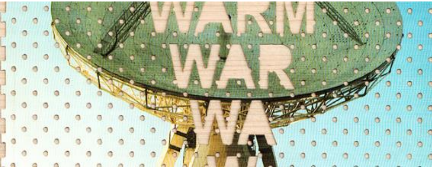
La puesta en marcha de un sistema (2015)

From November 21st 2015 to January 30th 2016 Opening : Saturday November 21st from 12pm.