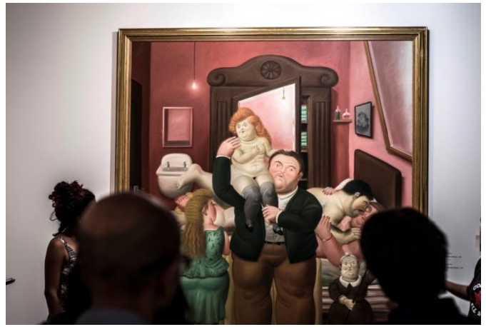
The Flower Fair (2015-2016)