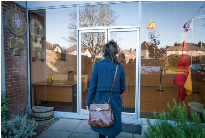
Stateless By Choice (2015)