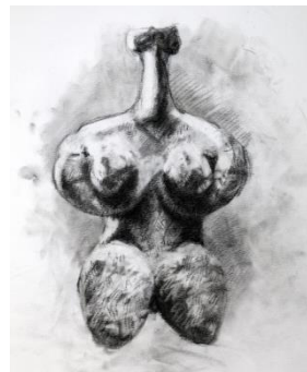
Good Intentions (2016)