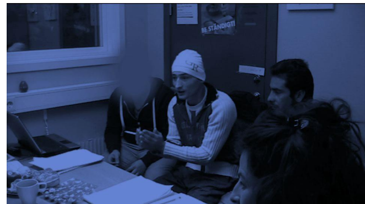
Support Swedish Culture (2014)

Support Swedish Culture (Sweden, 2014) legally employed four Roma who had been begging in Sweden's streets. The job consisted of collecting funds in public –in the same vein as an NGO- with the objective of subsidising Swedish culture. Through this practice they would have access to Swedish rights and social services. After completing the procedure, the art center that had requested the project canceled it unilaterally, questioning the project's ethics. Although the contracts and salaries were maintained, the Roma that collaborated on the project disagreed with the institution's decision, perceiving a prejudice on their intellectual and decision-making capabilities, supposedly attributed to their humble economic conditions. They also pointed out that receiving a salary for not participating in the project was a perpetuation of the segregation to which they are usually submitted. Support Swedish Culture is formalized through an audio and video device.