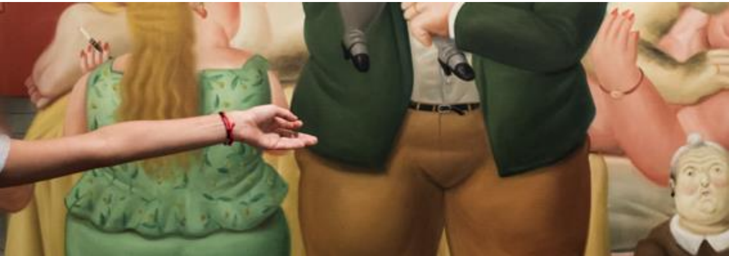
The Flower Fair (2015-2016)

From May 28th until September 9th 2016 Opening: May 28th 2016