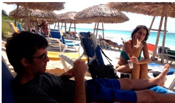
Political Degenerated Art (2014)